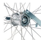
TETRA QR STD