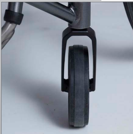
CASTOR WHEELS Unique design combines two functions in one. Easy rolling and also stability on soft surface.