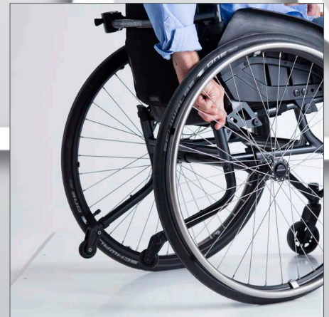
ANTI TIP DEVICE Activated and deactivated by the user sitting in the wheelchair