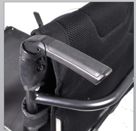
FOLDABLE PUSH HANDLES Discreet, lightweight and functional