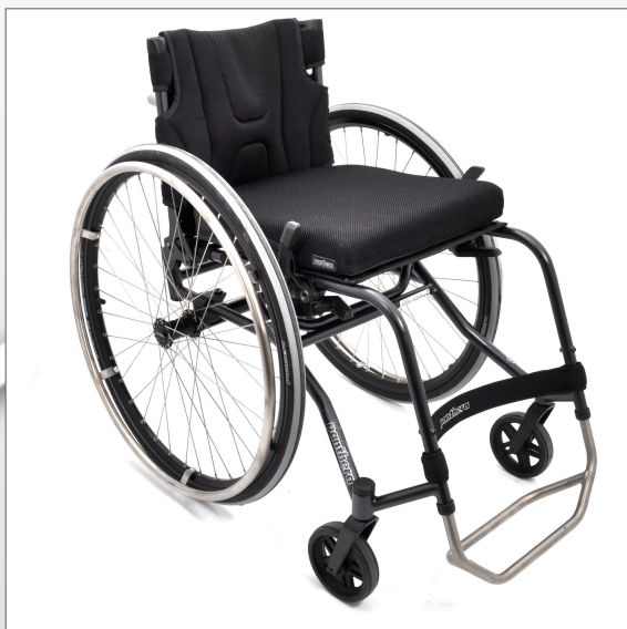
Panthera S3 S3, S3 short, S3 short-low, S3 large