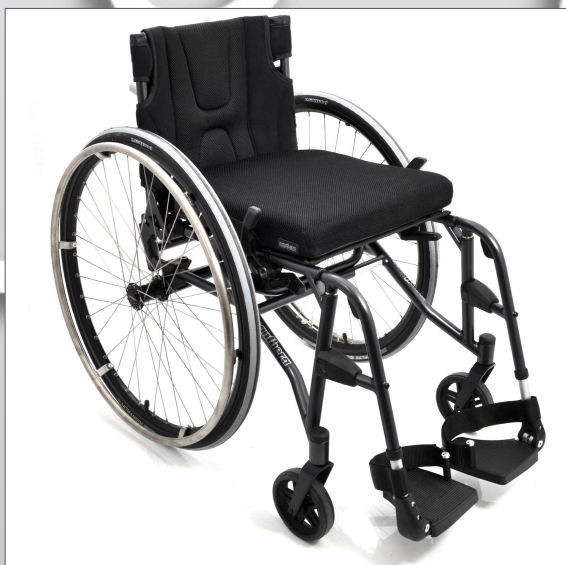
Panthera S3 Swing S3 Swing, S3 Swing-short