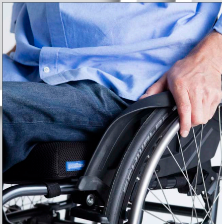
SIDE GUARDS Soft upper part creates new possibilities