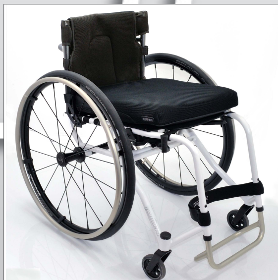
Panthera U3 Light / L